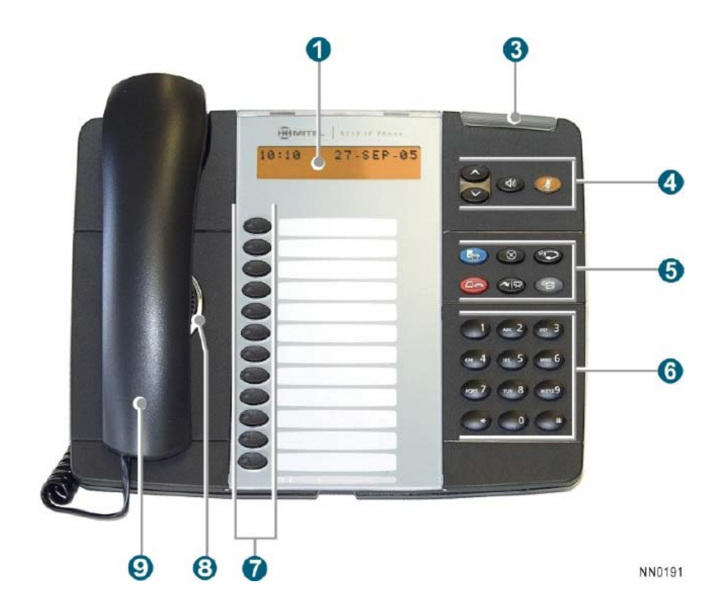
The 5212 IP Phone