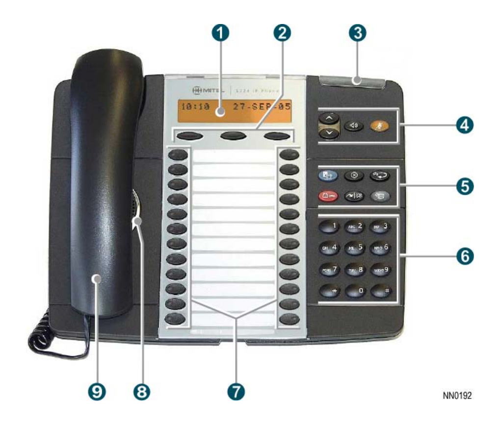
The 5224 IP Phone